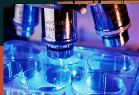
Fluorescing microscope in Biomolecular Chemistry lab (left) Sunset at Memorial Union Pier (above)