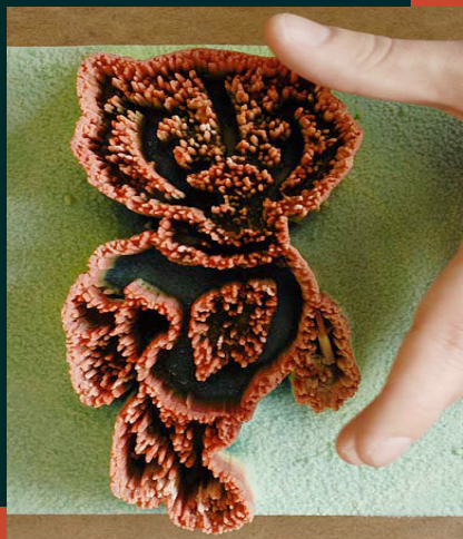
3-D model of "Nano Bucky" produced using ink-jet plotting technology and electron microscope imagery