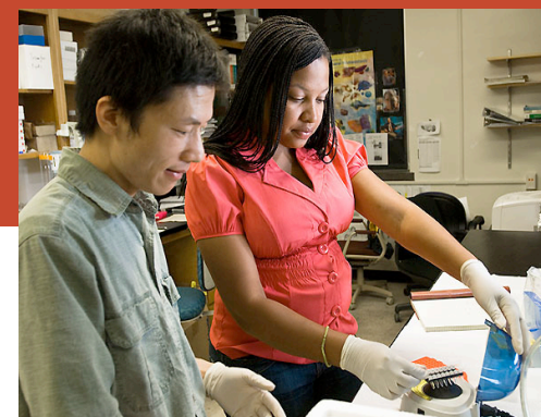
Students perform lab work in the Genetics-Biotechnology building